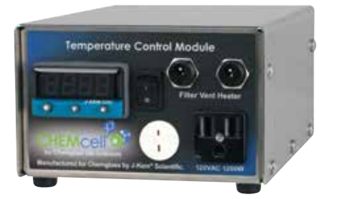
CLS-1200-2CH Temperature Controller