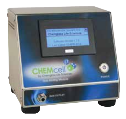
CLS-1200-GMM Gas Mixing Module